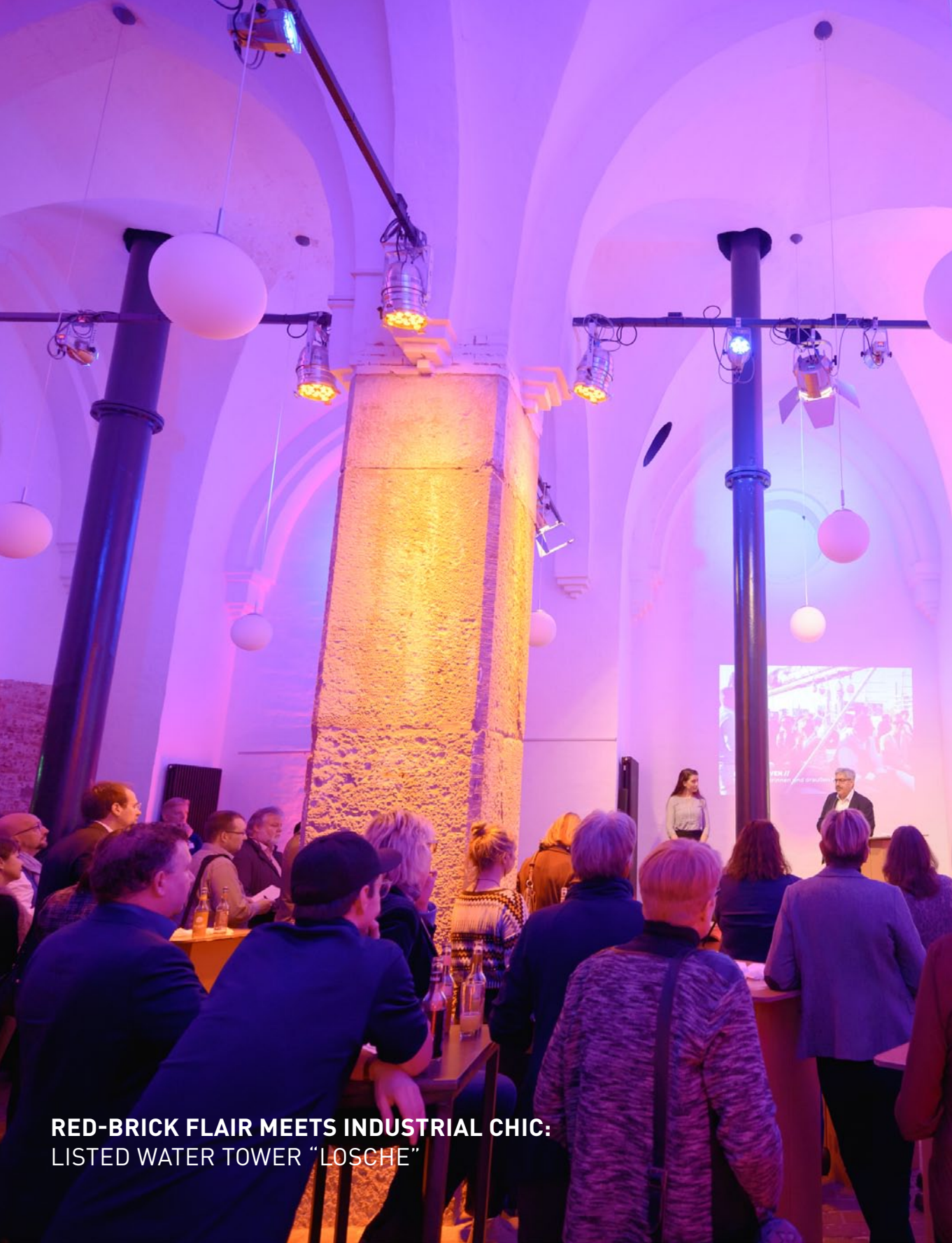
RED-BRICK FLAIR MEETS INDUSTRIAL CHIC: LISTED WATER TOWER "LOSCHÉ"