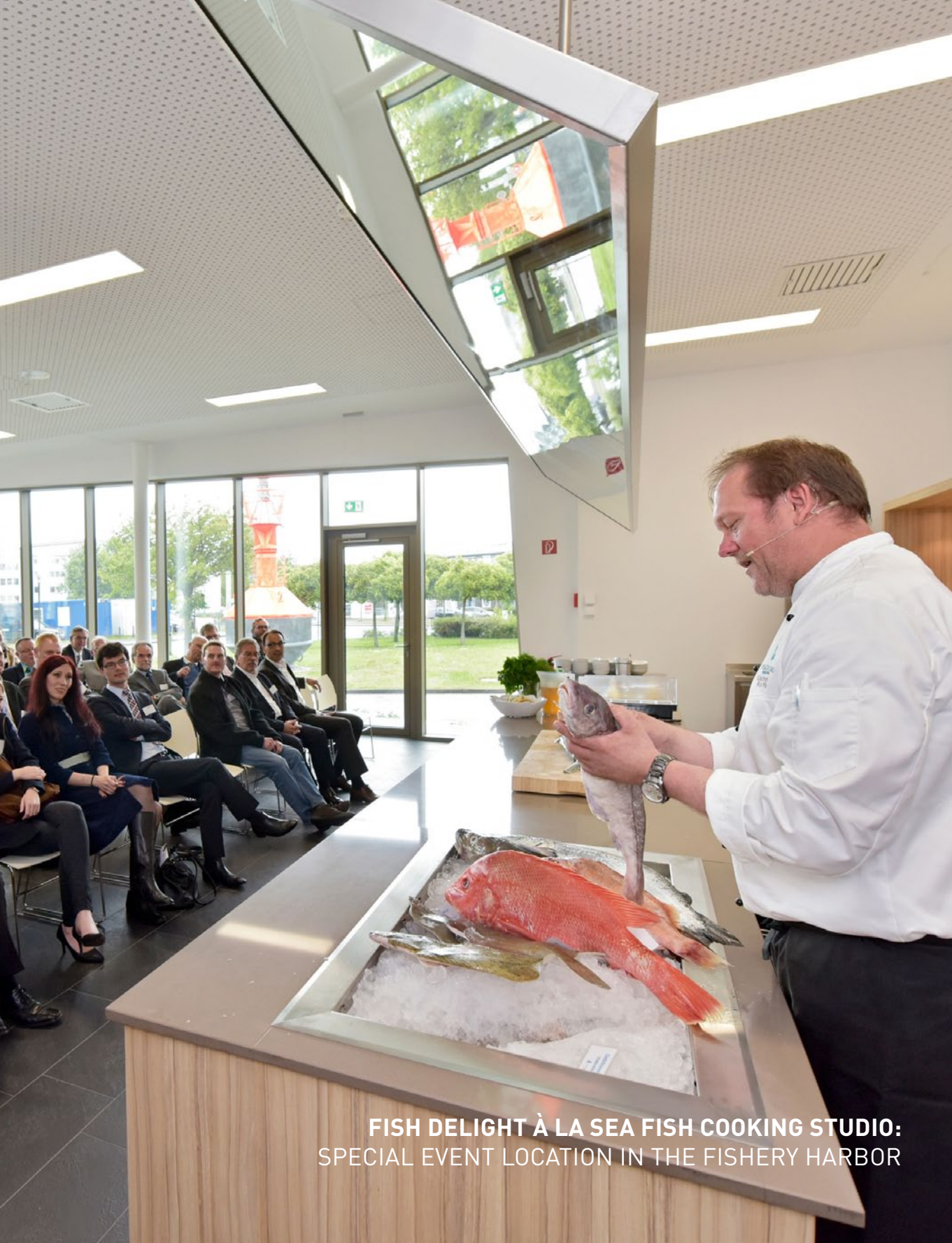
FISH DELIGHT À LA SEA FISH COOKING STUDIO: SPECIAL EVENT LOCATION IN THE FISHERY HARBOR