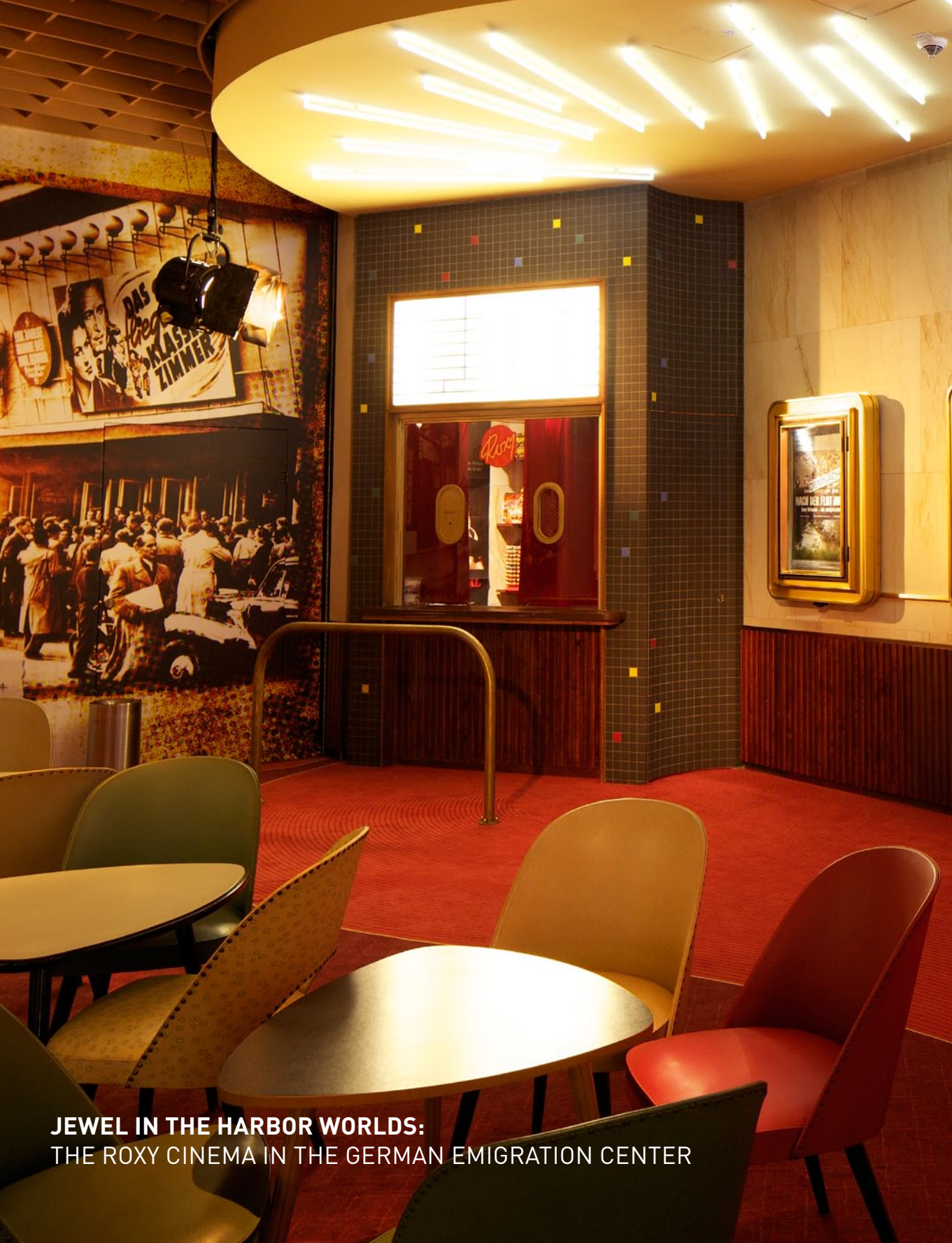
JEWEL IN THE HARBOR WORLDS: THE ROXY CINEMA IN THE GERMAN EMIGRATION CENTER